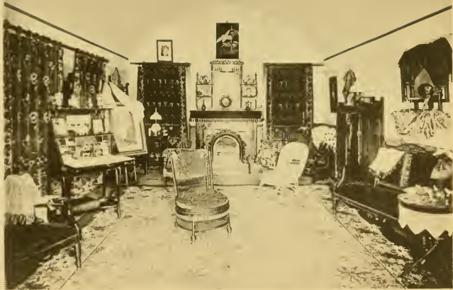
INTERIOR OF CASEMATE—OFFICERS' QUARTERS.